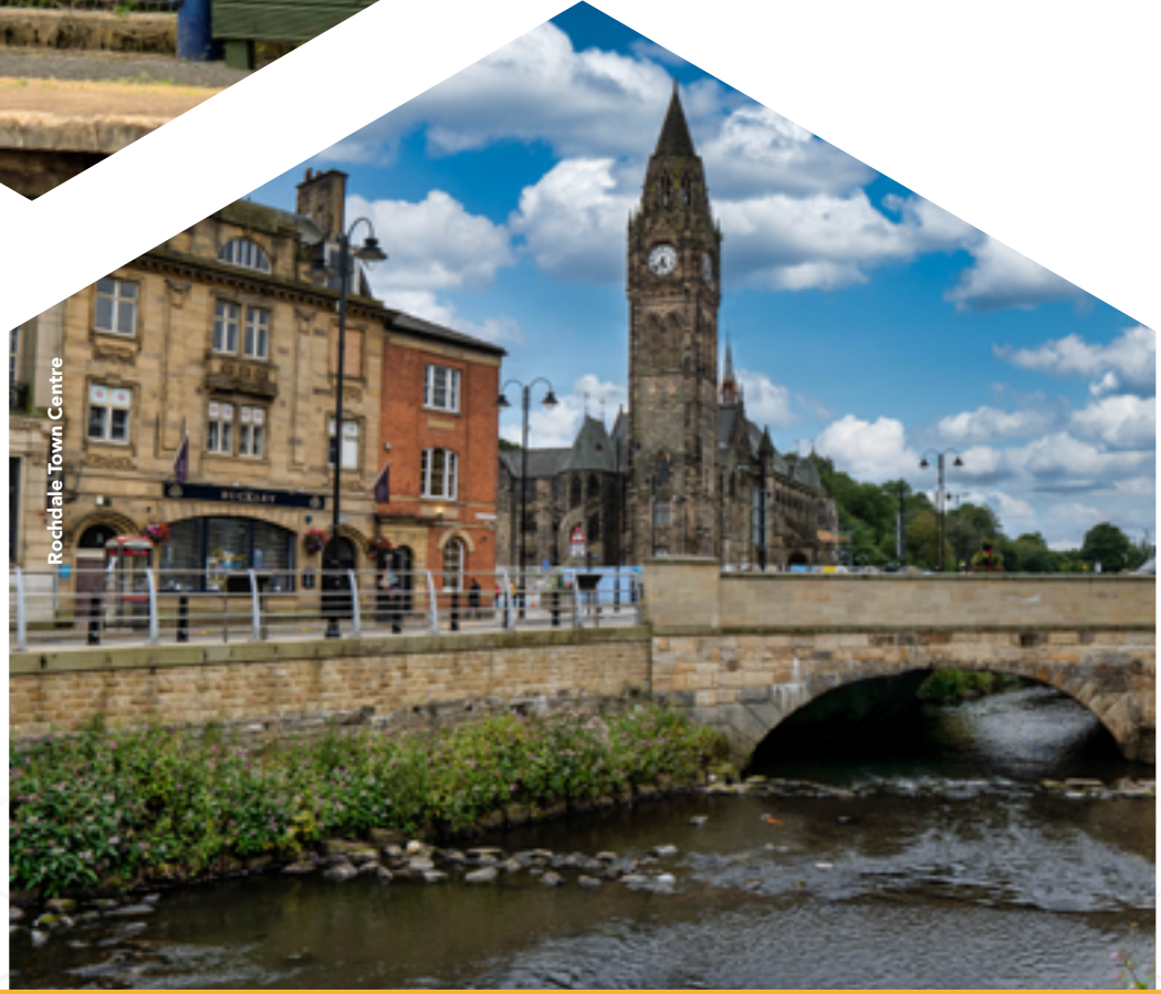
Rochdale Town Centre