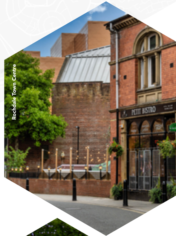
Rochdale Town Centre

For families looking for education opportunities for their children, there are numerous 'outstanding' and 'good' Ofsted-rated schools within a 5-mile radius of the development.