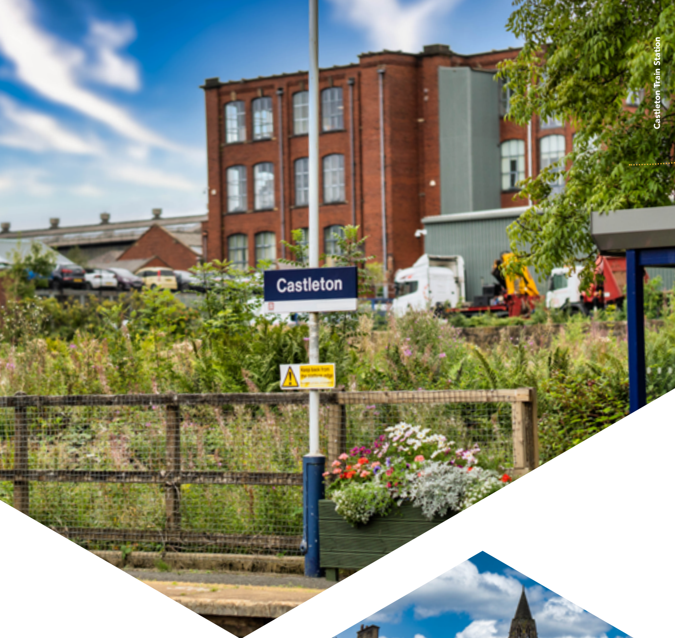
Castleton Train Station